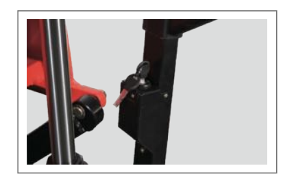
7 ACX 10E with key switch.

A Reliable wiring with protection. The built-in charger makes operations more autonomy and increases the operating range.