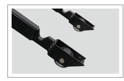
3 Anti- tilting skid

8 Where pallets with load are more frequently lifted, the ACX 10E with the electric lifting button makes lifting easier and more comfortable.