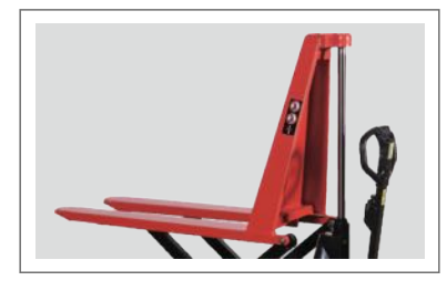
1 Robust chassis with reinforced forks (additional parts)